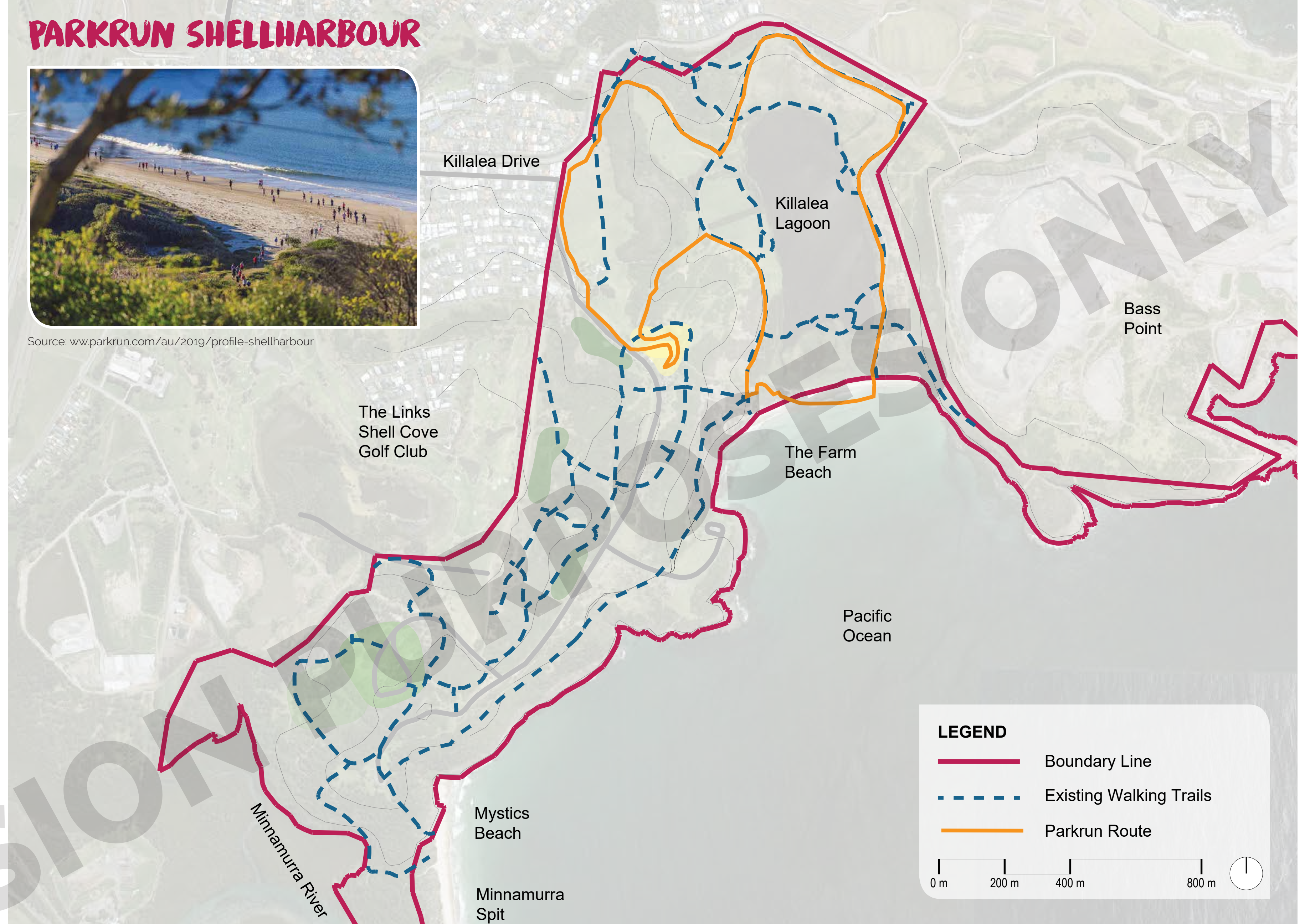
Walking trails at Killalea to link to new facilities and infrastructure